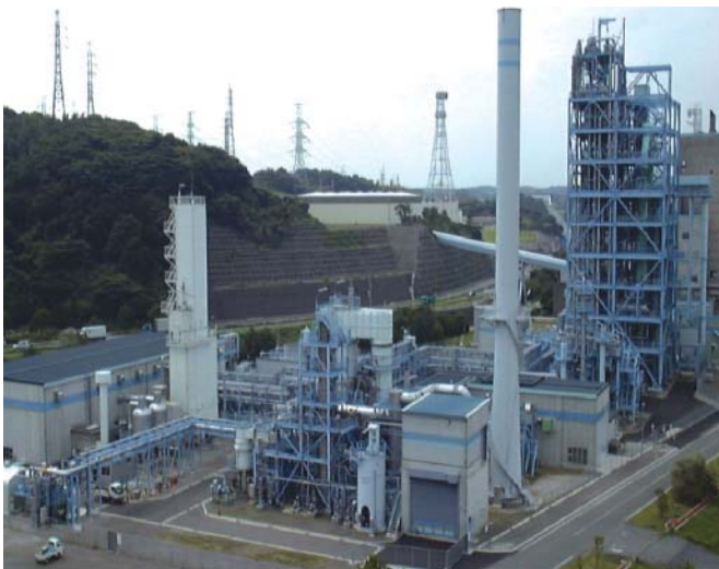
Photo 1 Total view of the pilot test facilities

With respect to practical application and commercialization, active promotion will be enhanced based on the results of the testing, research, and development.